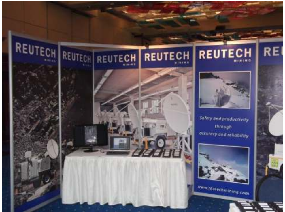
Reutech Mining's stand.

Reutech Mining is already looking forward to be part of the next in the series of Slope Stability conferences that is scheduled to be held in Australia in 2013.