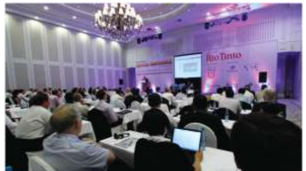
The Central Asia Mining Conference.